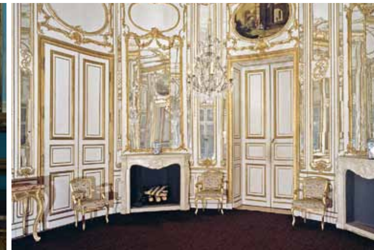
👑 The rooms in Solitude Palace are among the most beautiful created in the Duchy of Württemberg in the 18th century